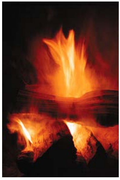
Extreme low light level of fireplace was captured with a 28-200mm zoom and Agfa Vista 800 color negative film.