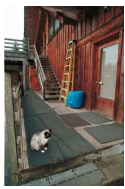
Extreme depth of field with a 24mm lens was possible with Fuji 400 color print film. Focus point was on the cat.