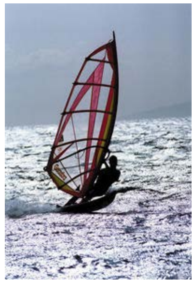
Summer fun in Hawaii with a 75-300mm zoom and Fuji Superia 800 produced images with stopped action and good depth of field.

If you use an SLR camera and like to shoot with long lenses, you'll find that you'll need high shutter speeds to minimize the effects of camera shake when hand-holding the lens. The rule of thumb is that you should use a shutter speed at least equal to the focal length of the lens. For example, a 500mm mirror lens will require at least 1/500 to hand-hold the lens and keep the image reasonably sharp, assuming that the subject is not very active. If a 500mm mirror lens has a minimum aperture of f/8, it would require a shutter speed of 1/400 or slower in full sunlight with ISO 100 film. When the light level drops, exposures would be in the 1/125-1/250 range and unacceptable. With ISO 400 film, the same lens in sunlight would require an shutter speed of 1/1600, which would increase your odds of getting a sharp image.