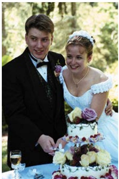
Kodak Portra 800 used in low light with a 28-200mm zoom lens. The high speed of the film provided the necessary depth of field in the available light, giving a more natural look than flash would have produced.