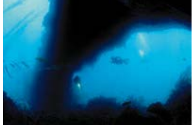
Wide-angle underwater image had a very low light level. A Nikonos-V with 15mm lens was used with Kodak Ektapress 640 to capture this scene.