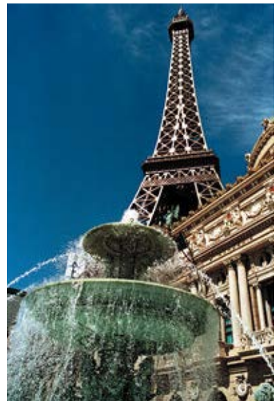
Kodak Supra 400 was used to stop the action of the fountain and keep the extreme depth of field in this 20mm shot.

Underwater scene with diver and turtle required extreme depth of field to keep both in focus. Fuji Superia 400 color negative film was used in a Nikonos-V camera with a 15mm lens.